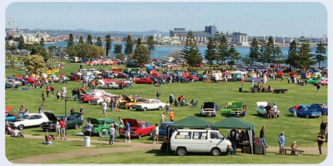
Hunter Valley Torana Club Annual Toranafest

The site has been designed to cover a range of topics of interest to the majority of motoring and classic car enthusiasts, and features a free classified system, event calendar along with plenty of feature articles and rich multimedia to ensure visitors return again and again. Each week over a dozen articles are added to the site to ensure the content is kept fresh and interesting.